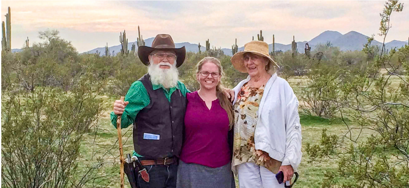
Enjoyed time with my family in Arizona this past January