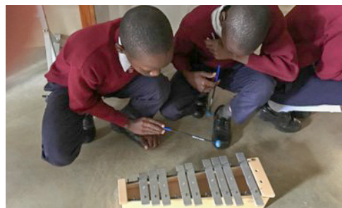
Grade 7 Music class

I have been able to have fun with my students in Rafiki School in exploring some of the instruments that are here at the Village. The students are excited and eager to learn. I am so thankful for the opportunity to work with them.