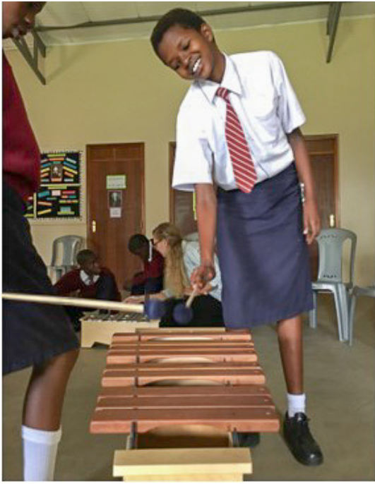
More of Grade 7 Music class

Thank you so much for your prayers and support. It is through your prayers and generosity that this ministry is made possible!