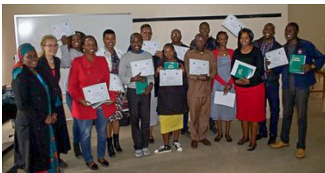
First Church Music Seminar Graduating class

During the final sessions of my church music seminar, I selected an article from The Gospel Coalition to share with the attendees. The title of the article was "The Slow Killing of Congregational Singing." I had anticipated some debate during group discussion but, after reading the article, the students agreed with every point of the article. What they said broke my heart. They declared, "There is no slow killing of congregational singing. It is already dead." We had a long conversation considering how to bring congregational singing back into the churches. I pray that the Lord will use our discussion to bring congregational singing back into these churches.