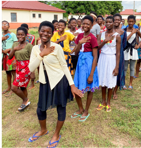
Since it was a holiday, the young ladies were free of their school uniforms for the day.