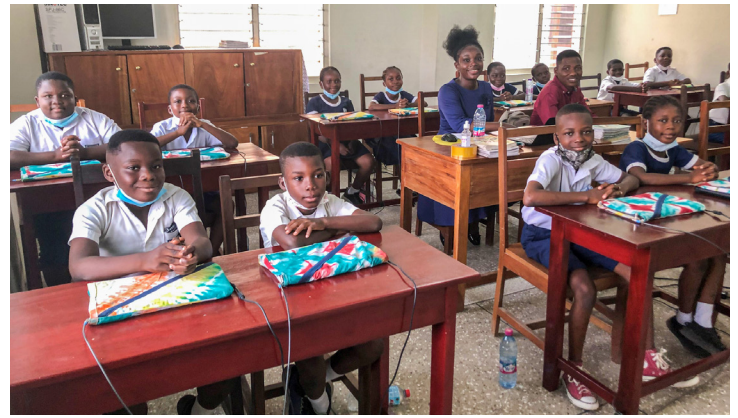
The grade two students are shown eagerly anticipating his class!

March 7 was Ghana's 65 th Independence Day! The students found uniforms from previous years stored in an old trunk at the school. There were also wooden guns. As they showed me their treasure with delight and asked permission to use them for the Independence Day parade, I was focused more on the cobwebs, dirt, and termite dust! But they assured me they could wash them (by hand) and touch up the guns with shoe polish. Their joy, perseverance, and willingness to work hard won my heart. What else might they need? A flag, a commander, some drums, and a band leader. Let the parade begin!