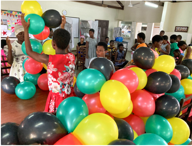
Of course no Independence Day celebration is complete without a balloon arch!