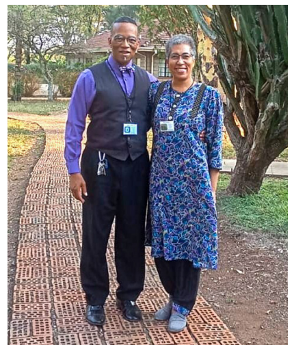
We have reached the Third Term of our Third Year with Rafiki!

Teachers from Tulip Christian Academy, a Rafiki Outreach school, arrived at the Village last week to benchmark at RCCS for three days. Their motorbus journey from Kimilili