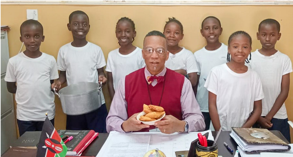
Grade four students delivered some freshly made mandazi to the Headmaster.