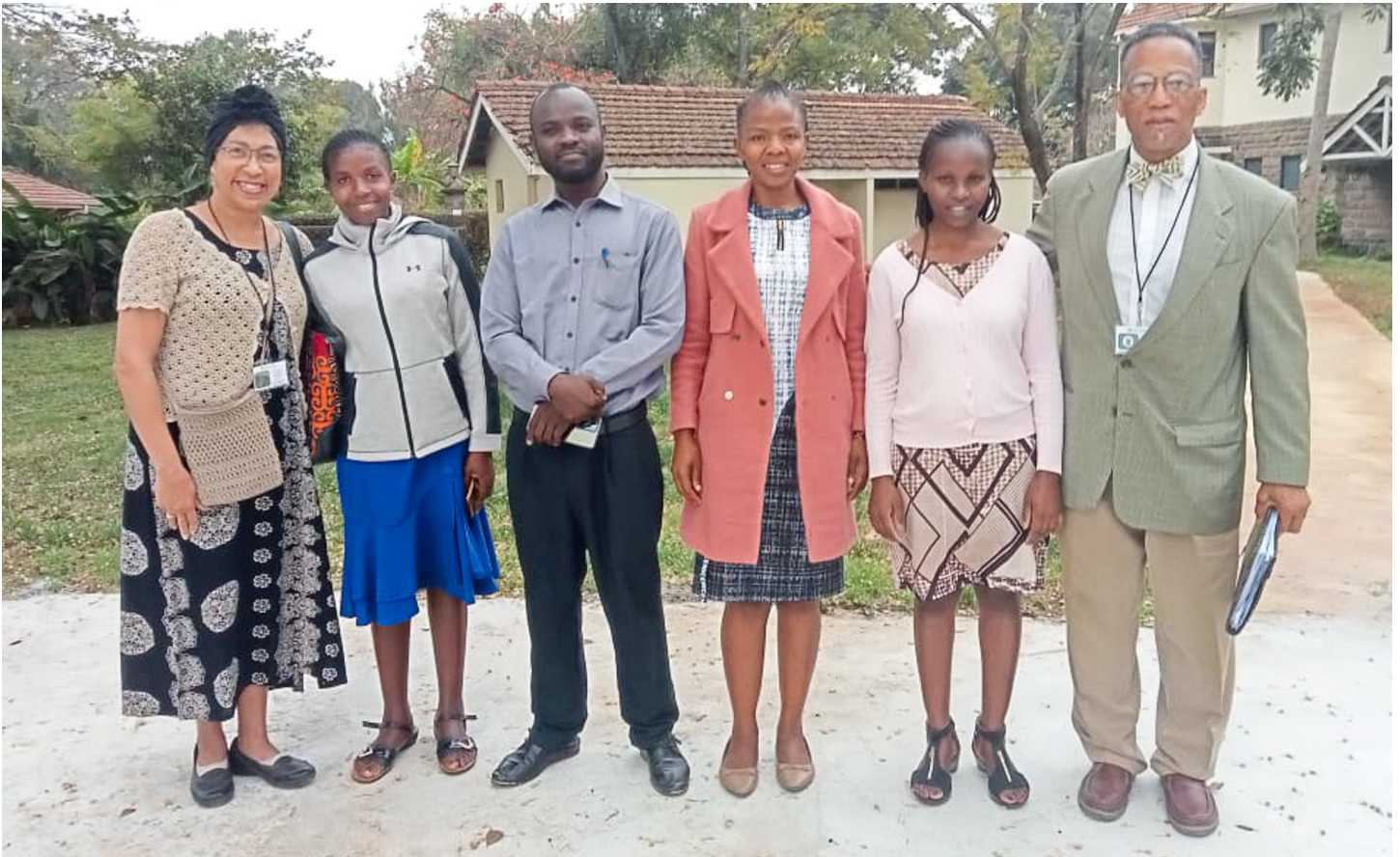
We welcomed teacher observers from Tulip Christian Academy.

(in Western Kenya) began at 6:00 a.m. Sunday and they reached Rafiki just before dinner at about 5:15 p.m.! During their visit, they observed in preschool, Grammar, and Logic classes. They were amazed to see how even “the little ones” grappled with thought-provoking biblical themes. The miraculous thing about God’s Word is that it speaks to every age. The group returned to their school excited to share what they had learned and experienced here.