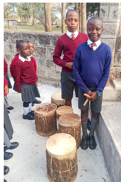
Our school bongo players rhythmically summon students to morning assembly.