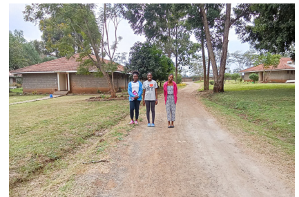
Some of our seniors heading to a study session during the recent school break