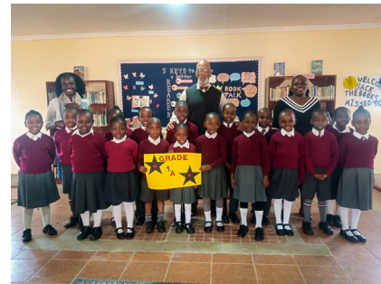
Rafiki Classical Christian School students Grade 1B on the left, and Grade 1A on the right