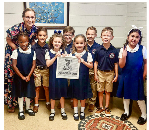
Covenant Classical Grade 1