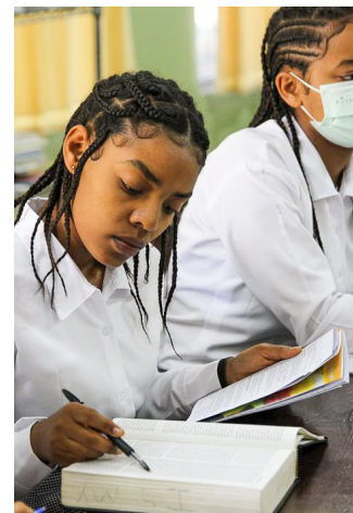
A student pondering the study of Exodus