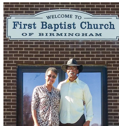
At First Baptist Church of Birmingham in Ohio

As this letter goes to press, we are excited to say that we have reached 72% of our funding for the first year! Our airline tickets have been purchased and we are finalizing the paperwork for our travel to Kenya—the reality of it all is starting to sink in. But we will step into this next phase with “no reserve and no regrets,” because God has given us His peace and we have been greatly encouraged by fellow believers.