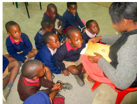
Little ones eager to hear the Word of God