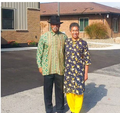
Connect Church in Akron, Ohio

In the past few months, we have had the privilege of sharing about God’s work through Rafiki and our mission opportunity with churches and small groups in the Southwest, Midwest, and the Mid-Atlantic regions of the U.S. We have tapped into the experience of fellow Rafiki Missionaries who graciously offered us guidance and insight through phone and video calls. We feel so blessed the more we are aligned with His ultimate “reconciliation plan!”