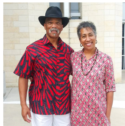
A sending lunch held for us at our old home church, Houston Northwest Church

The Village where we will be living is located less than 80 miles from the