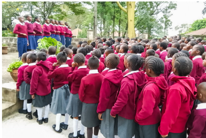
Morning assembly, led by School of Logic students