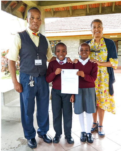
Chess champs head to Uganda!