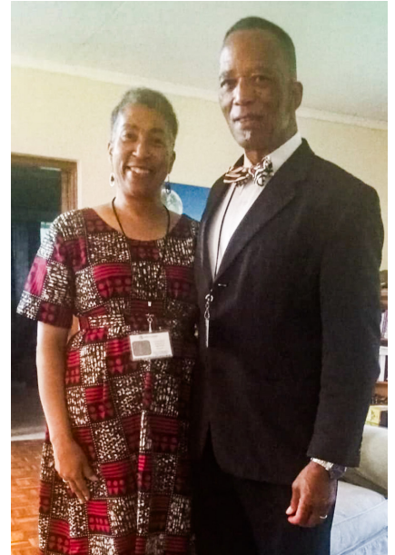
First week of term two

Early in May, we were blessed to receive a visit from the Home Office staff. Kenya was the last stop on their five-Village tour (following Uganda, Malawi, Rwanda, and Tanzania). During these semi-annual visits, the Executive Director and her staff meet with ministry partners,