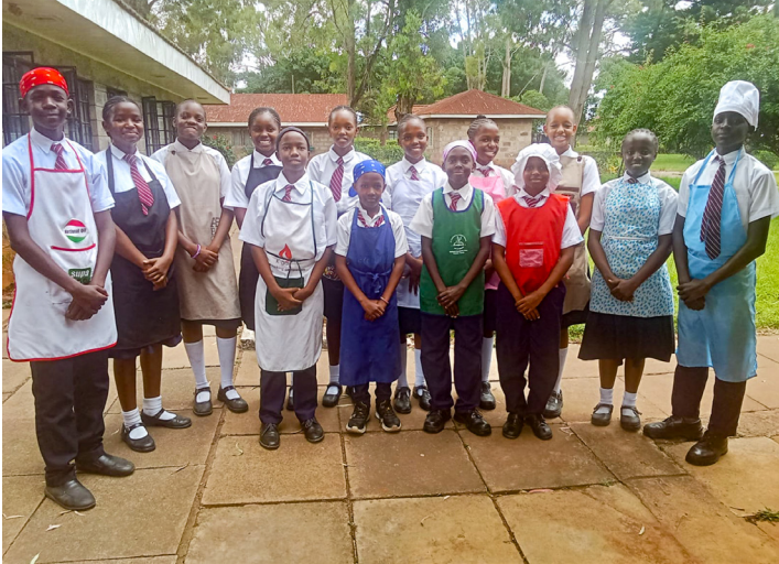
GL7B Home Science CHEFS!