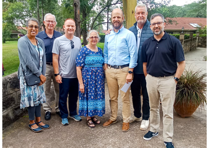
Floridians and Texans—short-term missionaries supporting the work in Kenya