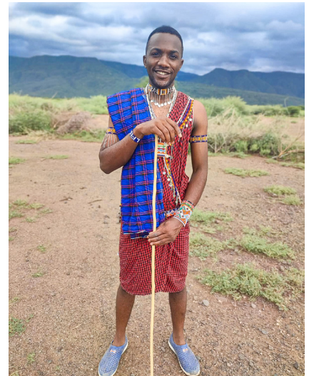
Our former GL3 teacher dons traditional Maasai clothing

Rafiki Village Kenya, established in 2004, has been home to 100 orphaned infants, toddlers, and young children. Each was raised here by loving cottage parents who modeled Christ to them on a daily basis. The children attended the Rafiki Classical Christian School (RCCS) within the Village compound, where they studied God’s Word first every day. They were taken to church each week and shared devotion time nightly with their cottage siblings. Then, when their studies were completed, they were lovingly launched out into the world.