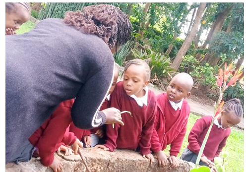
Students engaged in a lesson on insects