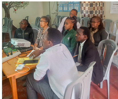
School staff gather for training