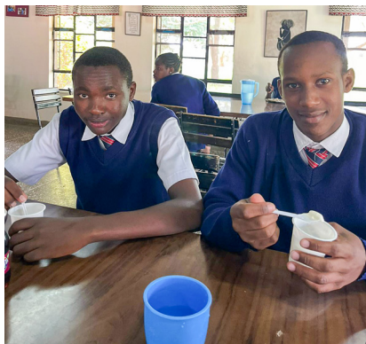
Rhetoric students enjoy Fanta Floats!

The executive leadership committee of our Parent-Teacher Fellowship had their first meeting and during their first order of business they listened to a presentation by Ambassadors Football Club-Kenya and unanimously voted to invite them to the next Parent Teacher Fellowship to present their proposal.