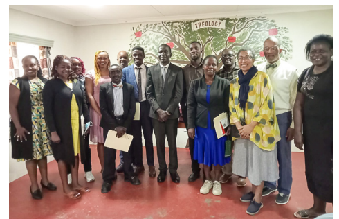
Leadership Committee of the Parent/Teacher Fellowship