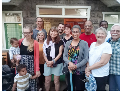
Bidding farewell to Colorado missionaries