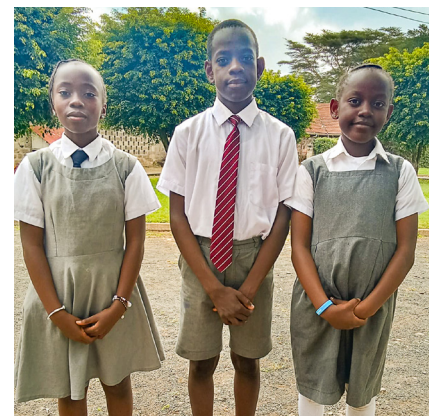
Spelling and Chess standouts at RCCS