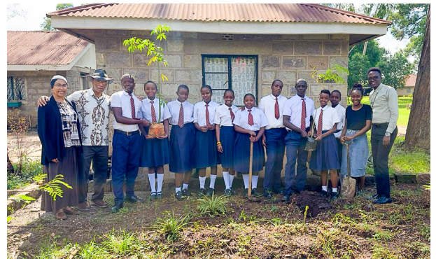
Tree-Planting Day in Kenya