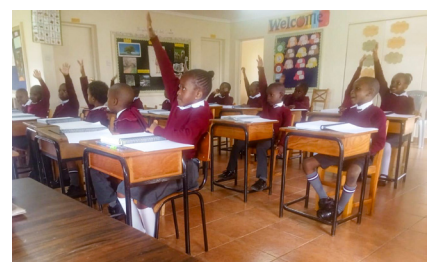
First graders during the first week