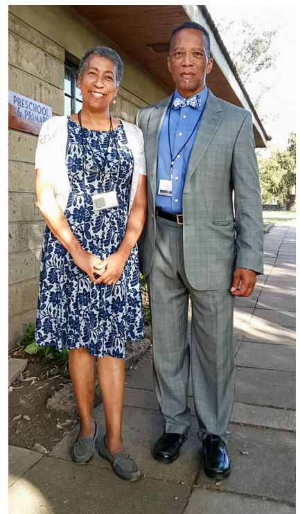
Our first day of school 2026

It was a sight to see the new first graders, who joined the all-school assembly on the first day of school, standing wide-eyed, as the rest of the student body recited the assembly sayings and character call-outs which