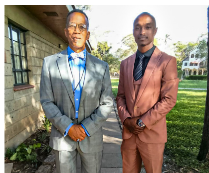
Our fourth teacher from the teachers college