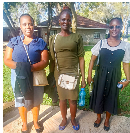
Three of our new teachers