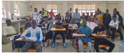
Saturday school attendees

students about honoring God through their deportment, manners, and love of neighbor. For the older ones, we resolved to start the traditional “Saturday School” just a bit earlier than last year. These supplemental study sessions from 8am-12pm weekly help students to catch up/get ahead in the subjects they will face on the National Exam.