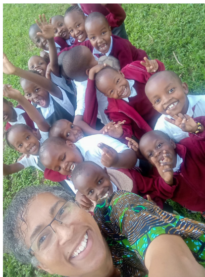
Substituting in second grade

During our visit to the States, we met with individuals and groups who were interested in short-term mission trips to Kenya this year! These Short-term Missionaries are always a blessing when they visit—serving as additional hands, feet, and godly role models for the day students and residents.