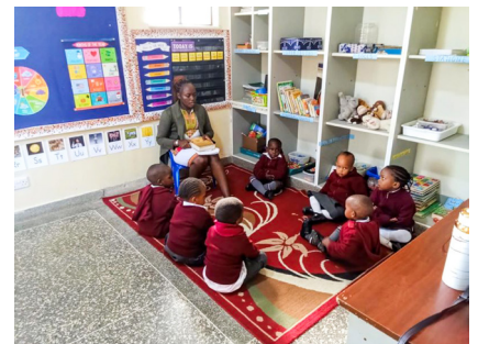
Our newest preprimary students