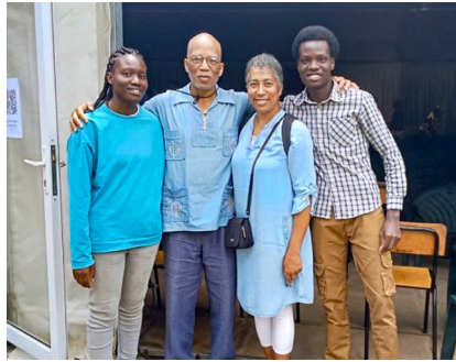
With our “Sankofa” speakers

In addition, we recently welcomed back the top two students of form four (2023 graduates) as “Sankofa” speakers, to encourage this year’s seniors about the importance of diligent and consistent study. We are pleased to report that this well-deserving pair—the president and deputy president of their class—have qualified for university studies, at no cost to their families!