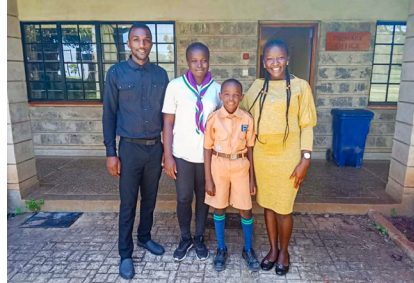
Scouts are ready!

As our student population has increased (passing the 400 mark this year!) so, too, have the opportunities for student involvement in co-curricular activities. This term, we are launching clubs for chess, math, and a Model United Nations, while receiving submissions for the next The Imani Standard newspaper and holding try-outs for several sports teams.