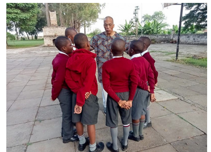
Headmaster counsels primary boys

Along with the roles of school administrators, we love the opportunities we have to guide, encourage, and disciple Rafiki students outside of the traditional classroom. We spend time coaching the younger