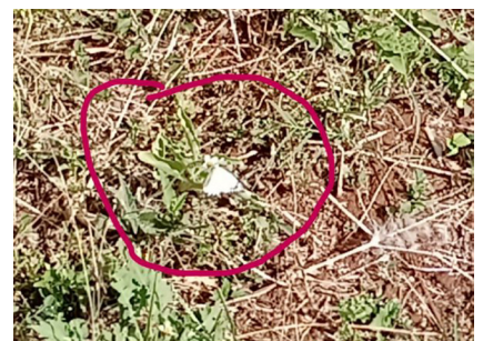
One of the white butterflies