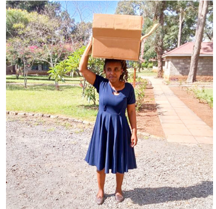
The ultimate administrative assistant