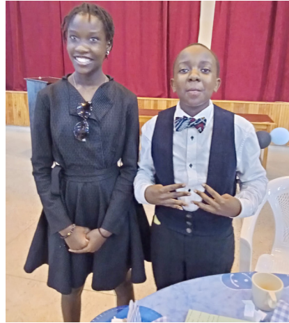
Two students in the School of Logic learn etiquette lessons at the High Tea