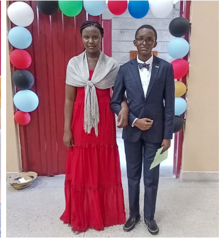
Two students from the School of Rhetoric enjoy learning social etiquette at the Upper School High Tea

If you have not yet contributed to this work financially, would you consider pledging to do so in 2024, so that our second year will be fully funded? God uses a community of willing hearts and various abilities to carry out His purposes. And His timing is always perfect.