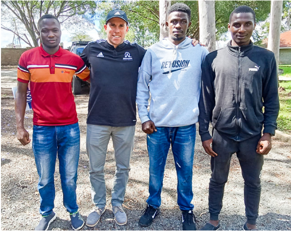
The Director of Ambassadors Football Kenya poses with three of the RCCS teachers and coaches

Please enjoy these extra photos from events here at Rafiki Village Kenya.