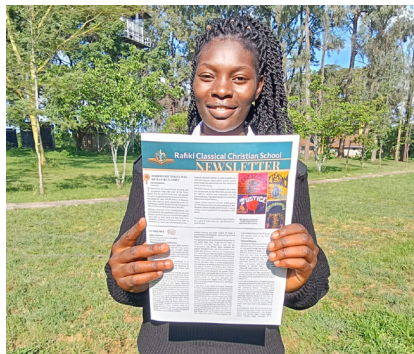
A Rafiki Security Guard excited to share the latest The Imani Standard

The school's 'pilot' newspaper, The Imani Standard , was published at the close of the second term this year. The intent was to help community parents to be more informed about student activities and accolades at RCCS, as well as to encourage young writers to develop their 'craft.' Feedback was so positive that additional Logic and Rhetoric students (in grades 7-12) began submitting ideas and writing pieces for the next issue soon after the first came out! As a result, a second issue went to print and was distributed in the third term.