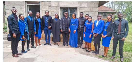
Teachers assemble for Term 2 Formal Hall

We hosted three Formal Halls, celebrating the musical, academic, and recitation skills of students at each school level. It is also a Rafiki tradition to end the school term with a Fun Day. Teachers spend this time enjoying the day outdoors with their students, cheering on their athletic feats as the four Virtue Teams faced-off in sporting events around the campus. This is the culmination of the Rafiki Games competition (which emphasizes good character, academics, sports, and the arts) for the 2024 school year.