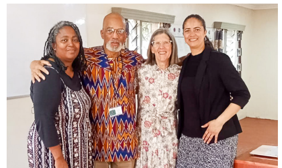
Three mighty Short-term Missionaries from Brazil and America—helping hands in Kenya