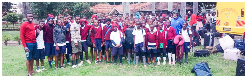
Students return from National Music Festival competition