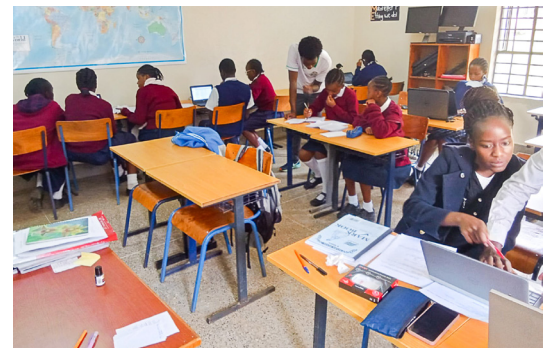
The Imani Standard staff

This term also marked the first anniversary of The Imani Standard —the student newspaper of RCCS. Over the last year, the literary skills of student journalists have been blossoming and the opportunity to “write a scoop for the newspaper” has become a popular pastime for Logic and Rhetoric (senior secondary) students, outside of the classroom. To date, the young writers have contributed thirty-seven articles and four original works of poetry to the once-per-term publication!