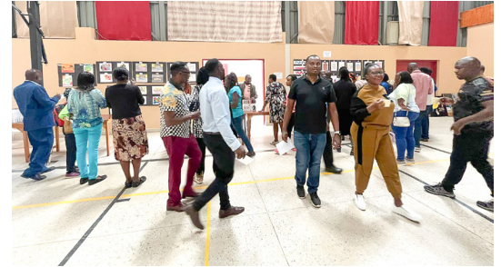
Parents voting on students' work at Artfest