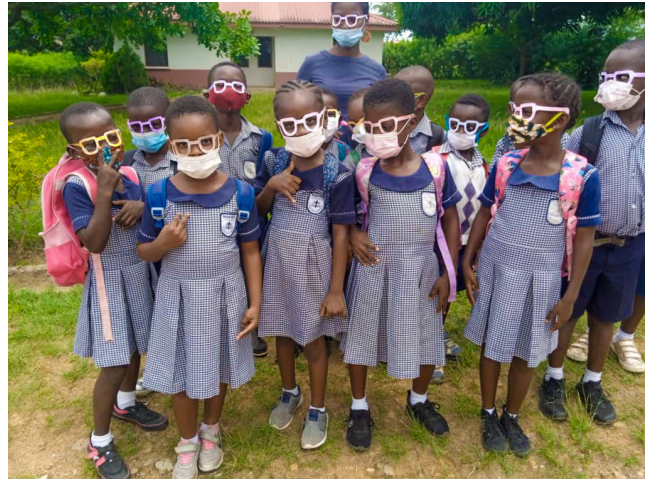
The Kindergarten class made "glasses" as part of their "My Eyes" unit.

appreciate the good, the true, and the beautiful. They learn how creation reflects the glory of God and that God created each one of them in His image.