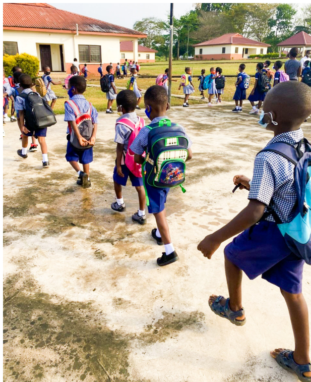
Students do not just walk to class, they march!

The school day begins on the sports court, where the Drum Core is playing and the Ghanaian Flag is flying. After the National pledge is recited, the national anthem is sung and prayer is offered, the Rafiki Classical Christian School day begins.