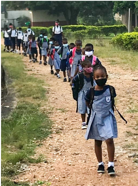
After breakfast, the children walk to Assembly.

The school day begins on the sports court, where the Drum Core is playing and the Ghanaian Flag is flying. After the National pledge is recited, the national anthem is sung and prayer is offered, the Rafiki Classical Christian School day begins.