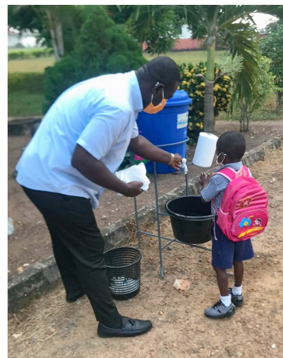
Upon entering the gate, the students wash their hands.

Please enjoy the following pictures of school life at Rafiki Village Ghana!