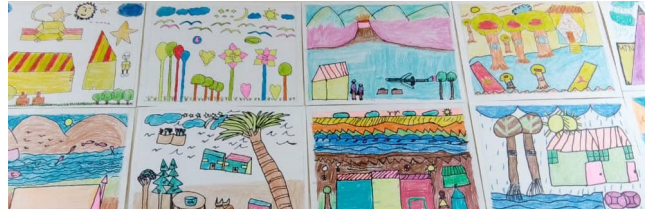
People around the world have different types of homes.

In Primary School the students continue learning about creation and the Creator. Their frame of reference expands to cover the peoples of the world. Artwork from primary school is shown below.