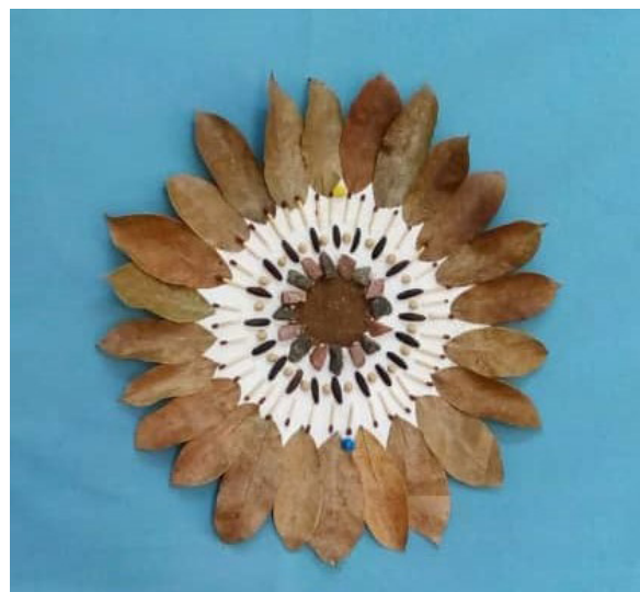
Leaves, pebbles, seeds, feathers, and dirt reveal how symmetry displays God's creativity, beauty, and majesty.