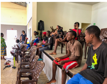
Watching a dodge ball game

Another blessing of the Christmas break is the chance to spend more time with the Rafiki kids! The busyness during the school terms often keeps me from being able to spend much time with them. But over Christmas, I get to connect with the kids by participating in the variety of activities planned to keep them busy, such as games, baking days, service projects, beach walks, or sports tournaments. I look forward to these opportunities to get to know them better.