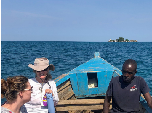
Lake Malawi Desert Island