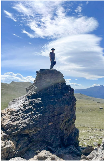
Rocky Mountain National Park

Recently, we took a fun day to visit Elephant Rock, a large granite massif a little south of us. By “visit” I mean scale the beast to the top, and then rappel down it. We trusted in hand and foot holds to get to the top, and then in ropes and carabiners to get us down safely. And we trusted in a leaky wooden boat and local guides to get us safely to and from a rocky island—which sported many wave-washed slippery surfaces—out in Lake Malawi. Jay trusted in the Lord’s protection to scale a stone pillar in Rocky Mountain National Park during our recent furlough. But most of all, we trust in our Rock to guide, direct, draw near, and protect our children, students, and staff as well as our Missionary team.