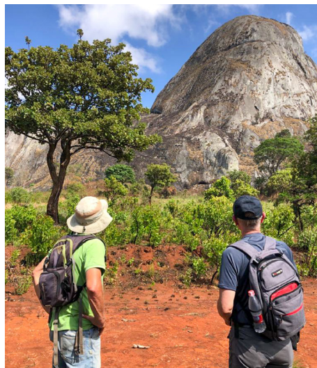
Contemplating Elephant Rock

Malawi has lots of rocks, of all types. Some are scattered across our campus, causing havoc for the grounds crew. Some are massive granite blocks like mountains. Some protrude out of Lake Malawi as rugged desert islands with scrub bushes clinging on for dear life. As the Malawi missionary team continues to serve here near the end of dry season, I am meditating on David’s description of Jehovah in Psalm 62: A rock, immovable, strong, a place of refuge, able to save, and trustworthy. We have had occasion to practically experience these comforting attributes of our Lord, especially His trustworthiness.