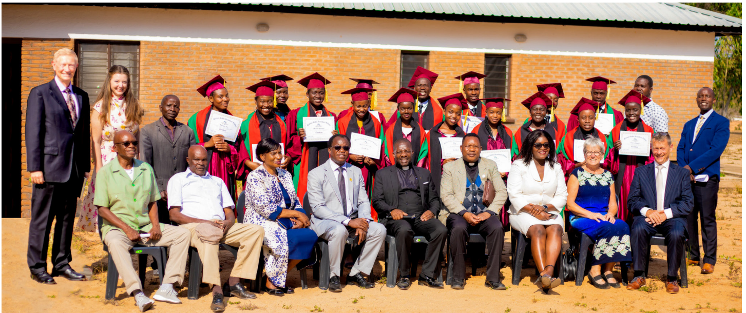
Class of 2023 with parents, Church officials, and friends