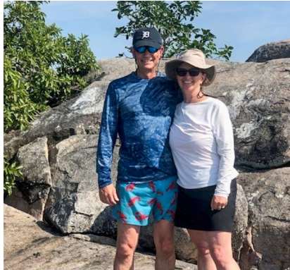
For God is our refuge