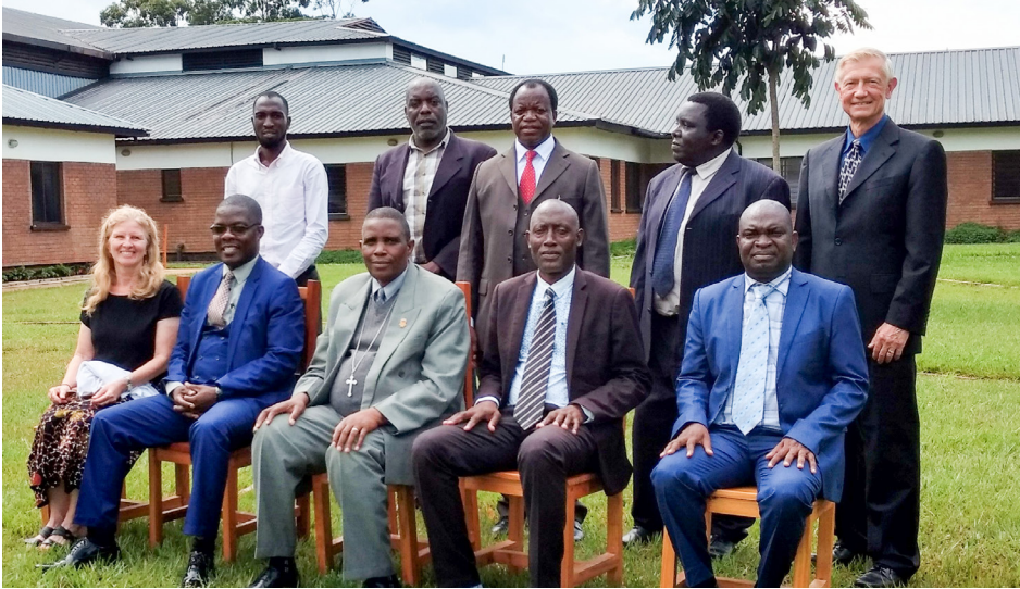
Ministry of Education and UNILIA officials with our teachers' college in the background

have a supportive partnership from this Ministry as we continue forward with plans to become a campus of UNILIA.