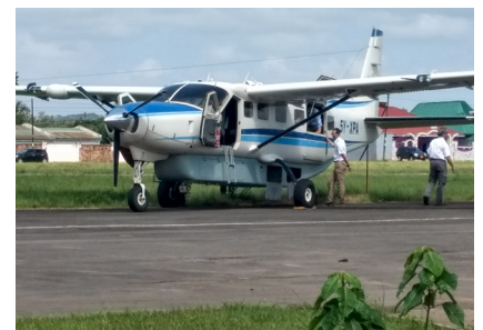
Africa Inland Mission

But other encounters are much more delightful. For example, the Home Office team came for another visit and rather than making the long drive up and back from the capital city airport, they arranged with Africa Inland Mission International (AIM) to charter one of their Kenya-based planes and fly direct to the airstrip in Mzuzu! Having a plane actually use this airstrip is about a twice-a-year novelty. We had to coordinate air routing and permits with the national government, purchase and ship jet fuel in barrels from the south for refueling, coordinate for customs agents to be onsite, etc., etc. And on their departure three days later, all the traffic on one of the main paved roads through town came to a standstill as crowds lined the airfield fence to watch the plane taxi and take off. Thank you, AIM, for supporting our Home Office team!