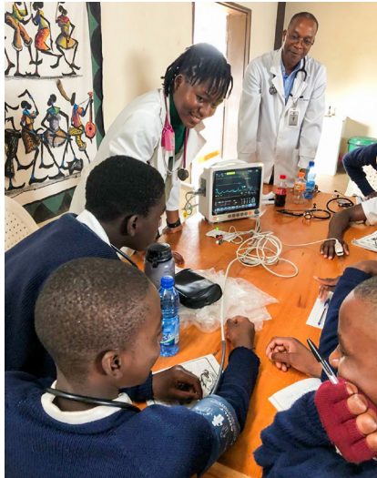
Medical professionals demonstrate equipment to our kids on Calling Day

University of Livingstonia (UNILIA). The picture below shows our Rafiki contingent as well as UNILIA partners meeting with the Ministry of Gender, Community Development, and Social Welfare. They were excited by the prospect of Malawi having a Christ-centered early education curricula, and gave us the “thumbs-up.” Please pray as we prepare to meet with the National Council for Higher Education as the next step on this accreditation journey for our teachers’ college. We have learned that not all government officials are enthused about granting approval for biblically-based and Christ-centered programs.