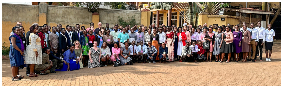
The New Old Way Conference in Uganda attendees