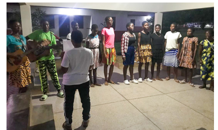
Practicing for church

Our residents continue to grow in joy and service. A group of our girls was asked to sing for their youth service at church. Two of them are mentored in guitar by another missionary here, and they lead their sister well. We worked on getting some harmony into the chorus, and it was great to hear them lift their voices to their Heavenly Father.