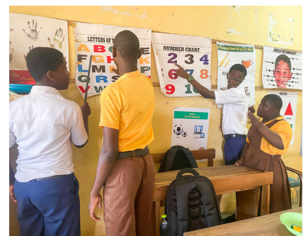
Taking the ABCs very seriously

One of our boys was able to read a story to a rapt audience, emulating teachers he has had for years who have read to him. Still others very seriously worked on pointing out numbers and letters. Thank God for these opportunities to develop serving hearts in our students and to teach them that God will use what He has given them to serve His kingdom.