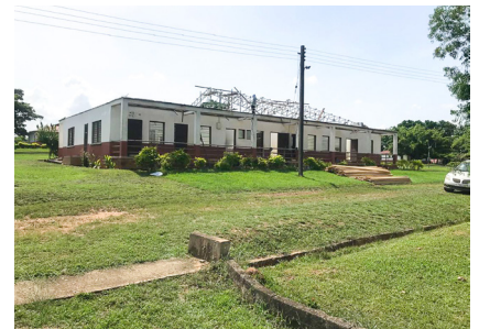
Help! I lost my roof!

We are at the oldest Rafiki Village here in Accra, and with that comes a lot of maintenance upkeep. We played musical classrooms with our teachers at the beginning of this term so that our maintenance team could start working on a new roof for our Early Childhood building. Please pray for work to be done swiftly and safely.