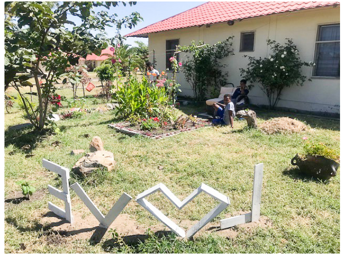
Part of the "wildlife" that strolls through my yard!