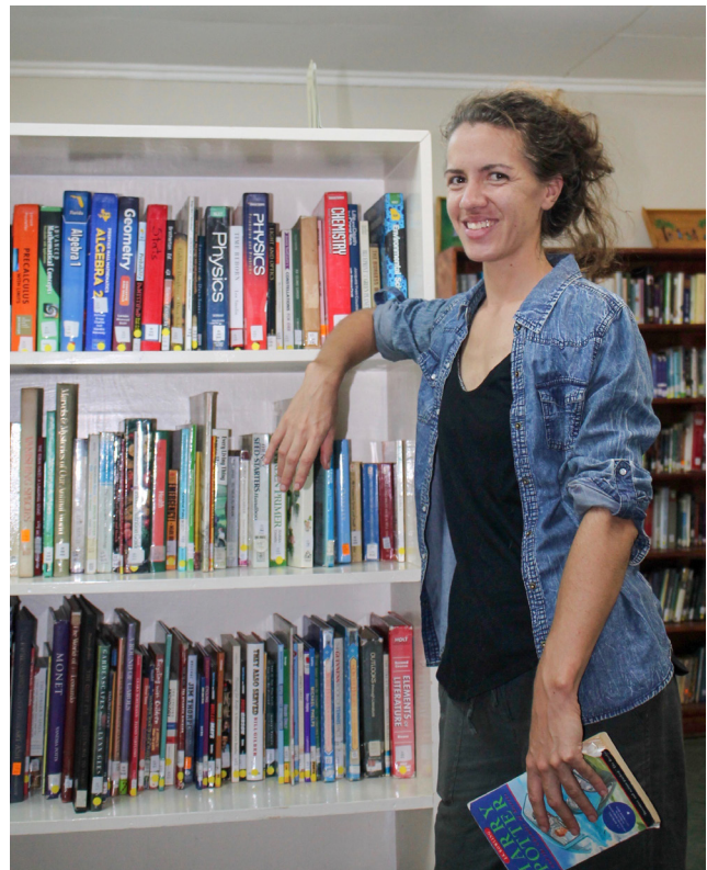
Me and my pile of books

of sinning, for God’s seed abides in him; and he cannot keep on sinning, because he has been born of God.” Jesus came down in perfect love and holiness so that we could be born into His righteousness.