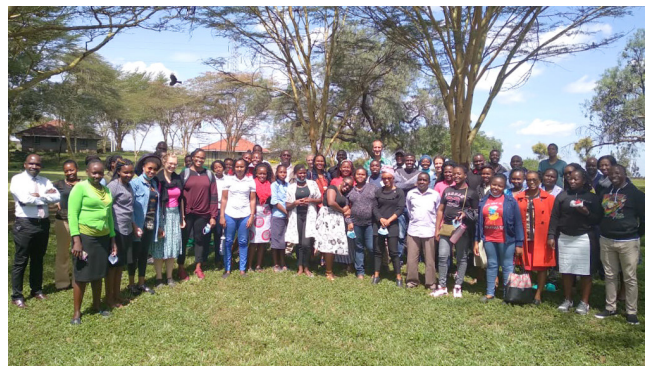
(Almost) complete picture of the full Village after staff lunch