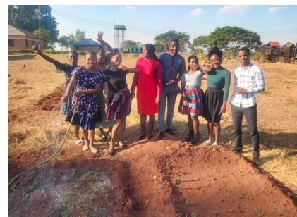
Agribusiness class tending their vegetable garden

Rafiki's mission is to help people to know God and raise their standard of living. Our mission is tied into the Great Commission, Matthew 28:19-20, "Go therefore and make disciples of all nations, baptizing them in the name of the Father and of the Son and of the Holy Spirit, teaching them to observe all that I have commanded you. And behold, I am with you always, to the end of the age." RICE in Malawi started out small, but we have a great group of students. Our program is a rigorous one where we start out each day with the Rafiki Bible Study. The importance of daily Bible study was outlined in my last newsletter. Another component of our program is agribusiness which teaches our students farming techniques and record keeping. Our students are learning the complete process from growing to selling crops, farming instruments and record keeping, which is the part of our curriculum that is required by NCHE. Malawi is mainly an agrarian society. This is in addition to our classical