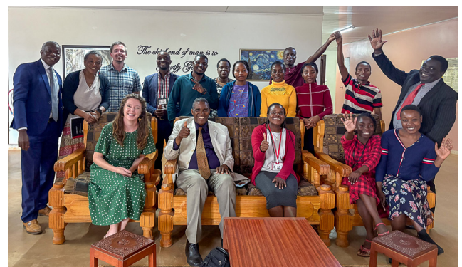
UNILIA staff (Deputy Vice Chancellor, Registrar, and Director of Quality Assurance), and our first cohort of RICE students, along with our Rafiki Missionary team