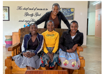
Our three graduates now attending RICE