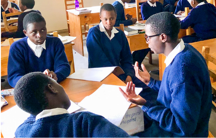
Rafiki Malawi Rhetoric II seniors in a debate studying forensic speeches, specifically logical proofs, including syllogism samples.

Another way to support is to be a prayer partner. Thank you for your support. As Christians we are instructed to trust and obey the commandments of our Lord and Savior, Jesus Christ. Remember what He instructed us to do in Matthew 6:19-21 “Do not lay up for yourselves treasures on earth...but lay up for yourselves treasures in heaven...For where your treasure is, there your heart will be also.”