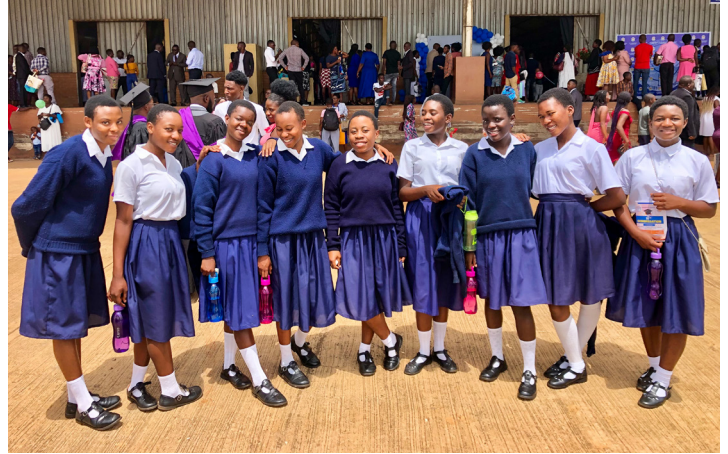
The Rafiki Malawi girls choir smiling after singing at the commencement ceremony at the University of Livingstonia where the president and first lady of Malawi attended.

“May grace and peace be yours in the fullest measure.”