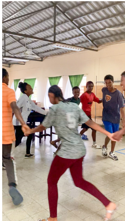
Teaching grade 8 students the folk dance "Old Brass Wagon"

During the following three weeks, teachers led activities with resident children. I joyfully taught all of them music. Remember, I am unable to teach older students during the school year due to their rigorous national curriculum. But how wonderful to witness their swift progress during such a short time. We even held a culminating mini-recitation which included a live art demonstration, history of the periodic table of the elements, a practical Excel presentation, and two sung canons and a folk dance (that I led). Everyone expressed their appreciation for the addition of my music skills in the school.