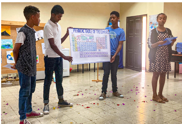
Grade 7 students presenting on the periodic table

Following this time of very full schedules, I got to enjoy a time of relative quiet due to the annual family visit for all but nine resident children. For three weeks they got to reconnect with extended family members and experience life outside of the Village while helping cook, clean, babysit, and share what they are learning here. One girl even got to lead her grandmother to saving grace in Jesus Christ! Praise the Lord!