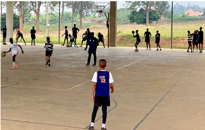
It is typical to see students hard at work practicing their basketball skills after school, or on Saturday mornings.

And now, enjoy some pictures from the last three months!