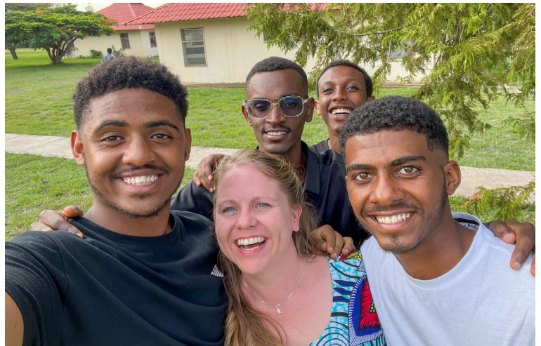
It was so sweet to reconnect with the students in Ethiopia when I went for this year's high school graduation.