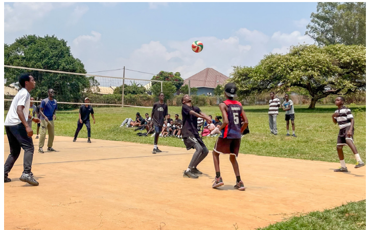
Students enjoy a variety of activities on field day including a rigorous game of volleyball.