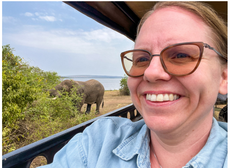
An exciting snap of an elephant on last weekend's overnight safari with the resident mothers.