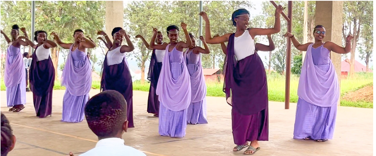
The traditional dance club girls dancing gracefully at Celebration of Arts.