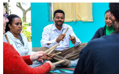
Making music with some of the teachers as I taught them the preschool music curriculum this summer

I really do not think there has ever been a time I was not thankful for something. In fact, the more that I see the beauty, majesty, and goodness of God, there are even more daily ways to be thankful. This year was certainly not without its struggles—particularly when I had to leave Ethiopia unexpectedly last November, but I have seen God's faithful leading wherever I have been. From Ethiopia to Arizona to Rwanda back to Ethiopia again, it has been a joy to make new friends and reconnect with old ones. And now, more than ever, God is equipping me to do the very thing He created me to do from the beginning. Whether I am teaching art, music, phonics, or penmanship to children or empowering the teachers to teach these subjects, I know I am exactly where I am supposed to be.