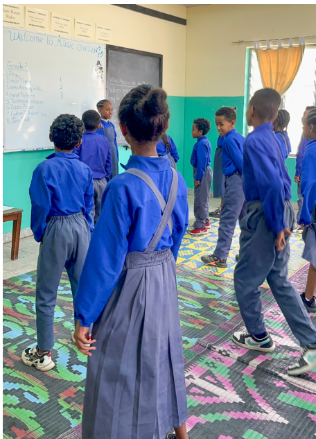
A third grade student leading her class in the fun action song "Pizza, Pizza"

Please pray that the Lord will provide more Rafiki Missionaries and more day student sponsors so that we can bring Bible study and classical Christian education to more needy children. Perhaps He is calling you to be the answer to one of those prayers? Visit www.RafikiFoundation.org to learn more.