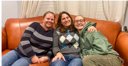
Two of the 40 people I got to spend time with individually during my time in the U.S.