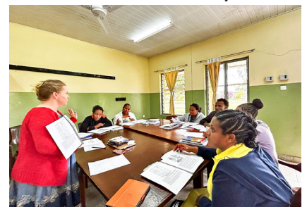
Teaching an art lesson to the preschool teachers during a typical afternoon class time.

Admittedly, I do love an adventure of seeing new places and meeting new people. This new position is going to stretch me very much, since I have never considered myself to be an administrator on a scale as large as this will be. However, I also know that when God calls, He also equips us for the job at hand. I look forward to joyfully empowering the teachers in