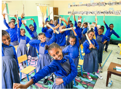
Ecstatic 3rd graders getting to take their recorders home for the first time!