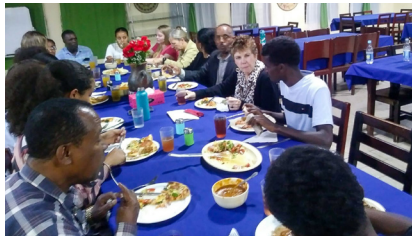
A special dinner with Home Office staff, national staff, missionaries and 12th graders. The students each shared about the specific impact Rafiki has had on their lives.