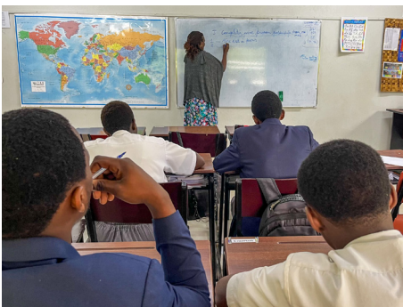
Grade level eleven French class