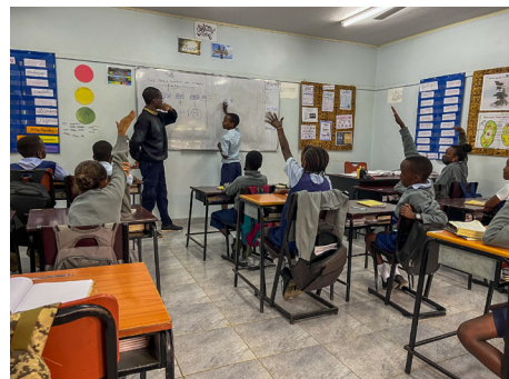
Grade level five math class