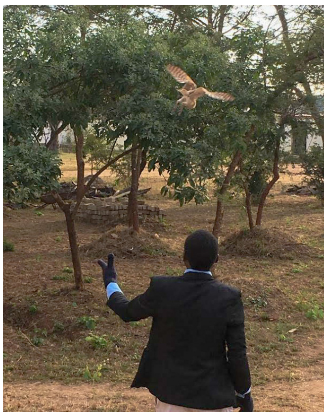
Releasing the owl

We thank you for your partnership with us and allowing us to serve the people of Zambia and to