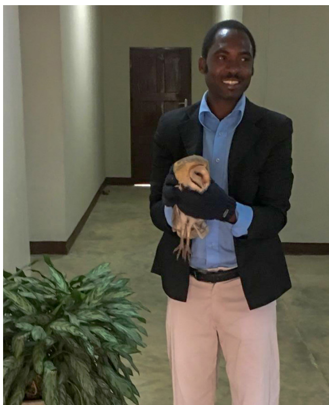
The RICE owl that tried to make the auditorium his home