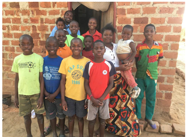
With family and Rafiki boys