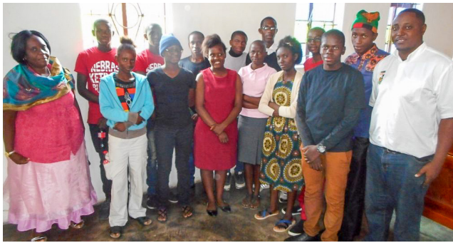
Rafiki Mother and young adults with seminar speaker attending the "Farming God's Way" seminar