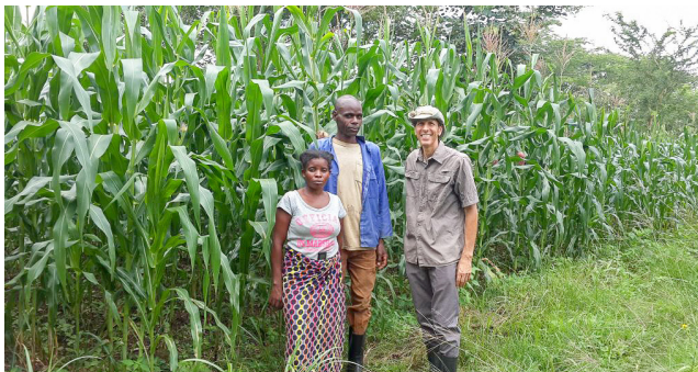
The FGW methods helped preserve the moisture in the soil, enabling our maize to withstand the drought.