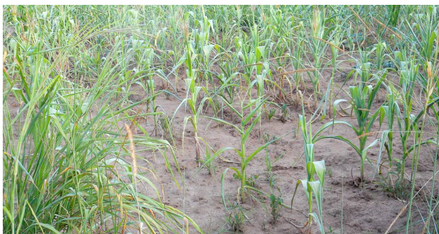
A maize field planted with conventional techniques (Maize is Zambia's staple food, its production is dependent on the rains that come in once a year normally from November to April)

When we returned in November of 2018 we were asked to assist with the RICE Program; which is a three year teachers college for young people to learn to become classical Christian educators. We helped to tutor the students and grade tests and exams. Lusubilo introduced the idea of learning to read for fun outside of the normal coursework. Some of our students coming from rural poor schools have never had access to a functioning school or community library and hence have never learned to read books outside the demands of having to pass national exams. We started meeting with the interested students during their lunch hour break once a week. We are currently reading together the book, Pilgrim's Progress by John Bunyan. It has been a wonderful opportunity to not only learn new words but to explain the truths of the Christian faith presented in the book.