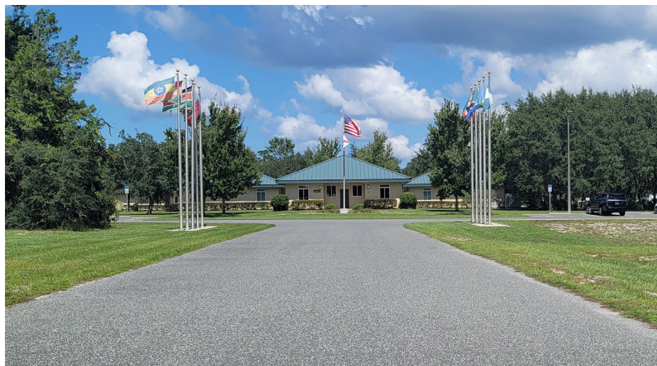
Rafiki Home Office in Florida