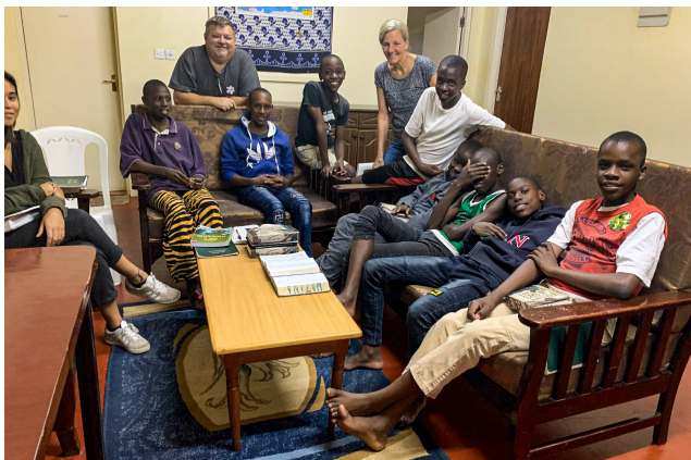
Evening devotions with a Rafiki Village Kenya cottage

This has been a long wait for us, but during this time, we are continually reminded of God’s call for us to go. The verse above was from church this past Sunday. We left for church that morning feeling a little discouraged and God met us there once again specifically with a sermon about how it is worth it to follow Jesus. One of the truths that morning was that we must forsake it all to follow Him. As we prepare to go, we have mixed emotions about leaving our families—especially our children—but God keeps asking us to trust Him, follow Him, and surrender the right to determine the course of our life. We are also planning on leaving a house that is still for sale as of the time of writing this letter. During this pandemic and election, it has been a time of not placing our hopes in people and things, but of placing our hope in the only sure foundation, Jesus Christ.