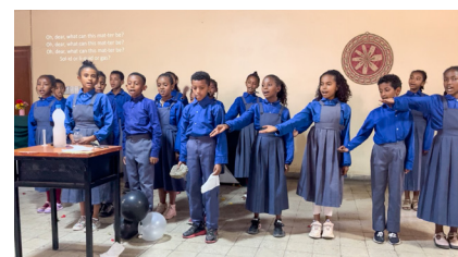
Grade 3 students sing about states of matter