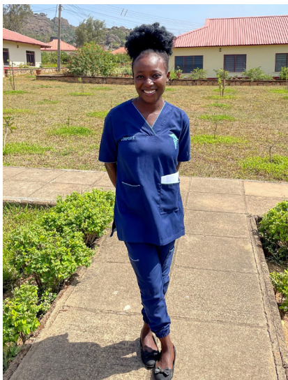
One of our Orphans in Nigeria who is now a school nurse