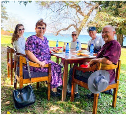
Fellowship with the Malawi team