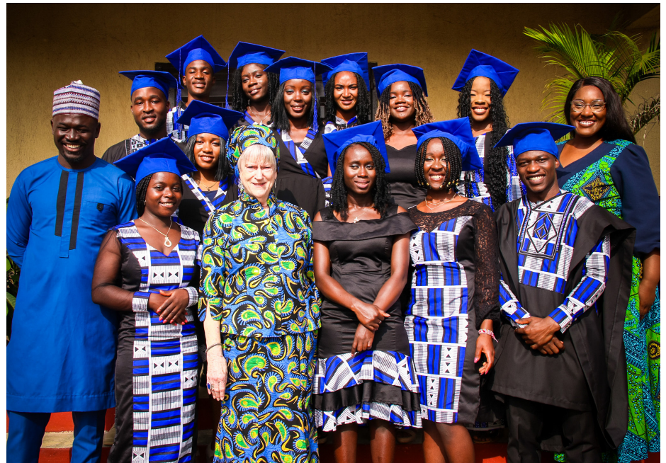
Rafiki graduating class of 2023

Another nine of our resident children graduated from high school in August. It seems amazing that we now have only eleven resident kids living on-site. At church, this means a greatly reduced choir size, but the remaining children are stepping up to fill roles. Their time has finally come.