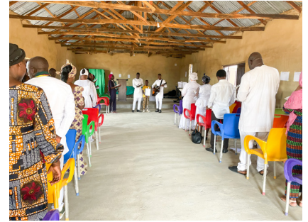
NKST Church service