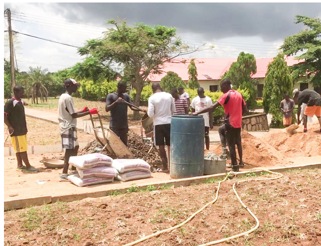
Resident boys using a concrete mixer

The boys have done a tremendous job of keeping grass mowed and trimmed (it is rainy season). They have also helped pour concrete pathways.