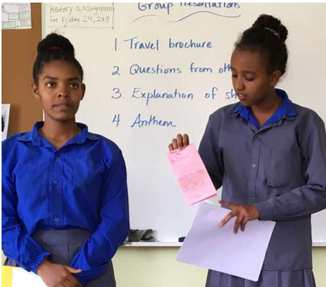
Grade seven students presenting about their own Ancient Greek City-State