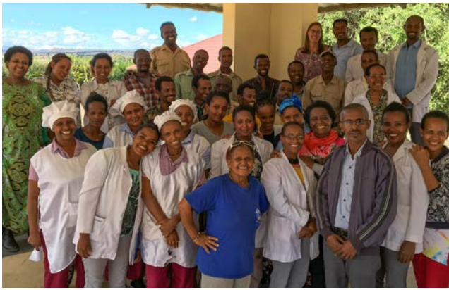
Rafiki Village Ethiopia staff