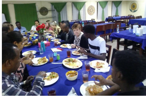
A special meal: good food, great fellowship, and joyful gratitude.

One final example of God's Word at Work to enlighten spiritual eyes through Rafiki comes from grade nine Language Arts. We have been studying The Pilgrim's Progress this term and recently read about Christian journeying through the Valley of the Shadow of Death. Students were asked to write a paper reflecting on a difficult event in their lives that God allowed them to go through in order to reveal His goodness and faithfulness.