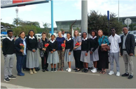
Grade 12 students welcome the Home Office visitors at the airport.

members to faith in Christ. Another expressed thanks for the loving people God gave her through Rafiki to minister to her physically, emotionally, and spiritually. All the students were grateful for the excellent education they have received at no cost to them. I praise the Lord for how He has worked in the lives of these oldest residents and for their spiritual eyes that see He is the one who deserves all the glory.