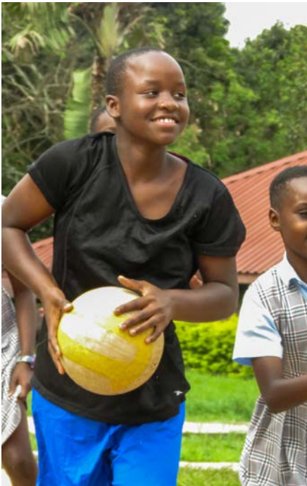
Primary girls at netball practice.