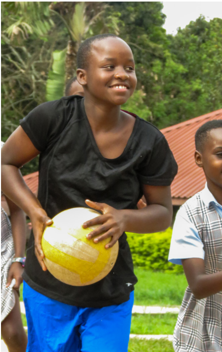
Primary girls at netball practice.