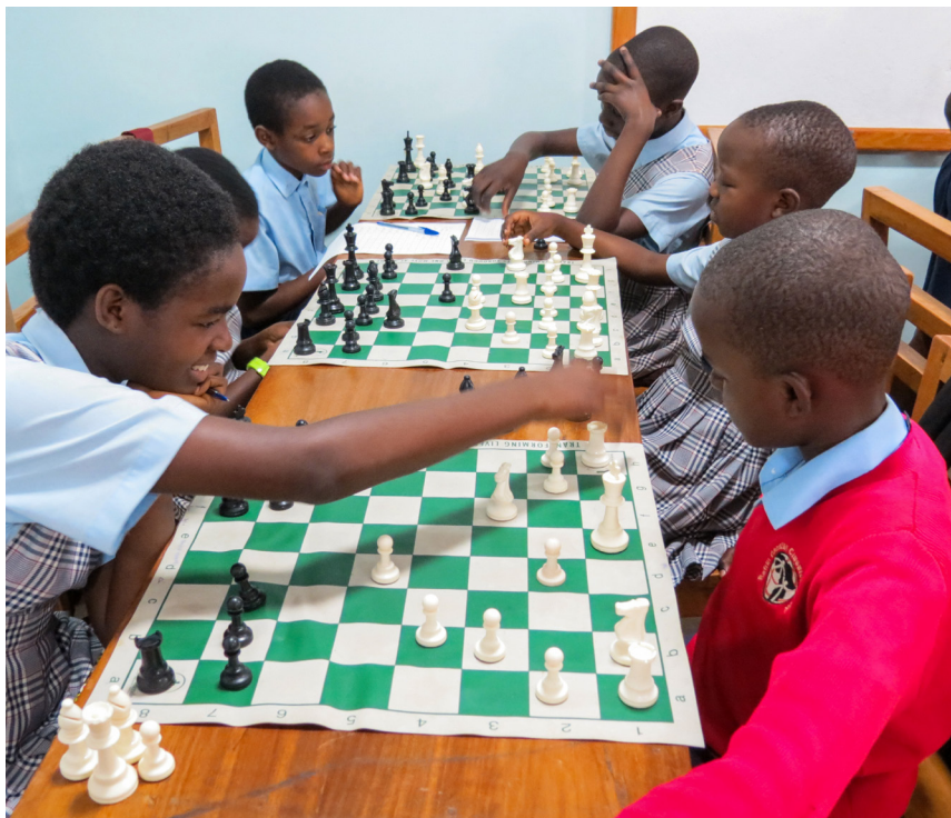
Afternoon chess club matches.