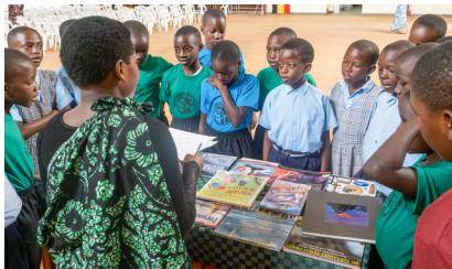
Reviewing books about weather