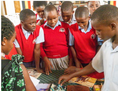
At the Air Travel table