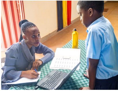
Checking out a book