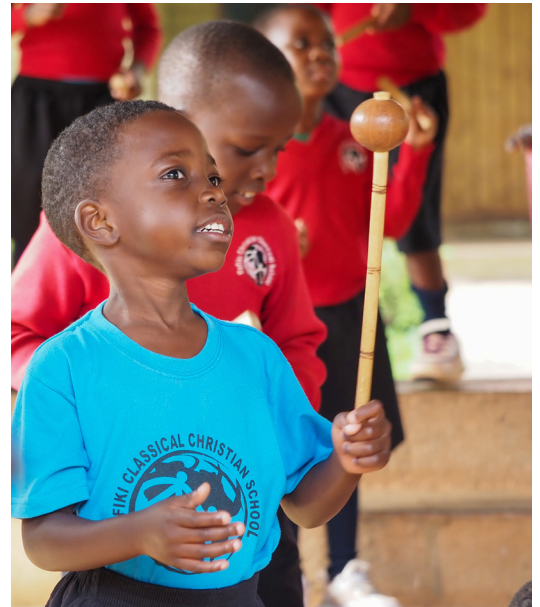
EC3 students celebrate the 100th day of school with traditional instruments plus cake, soda, and bubbles.