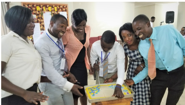
RICE graduates celebrate with cake

First, we are so thankful for the Lord's faithfulness. We successfully completed our first term at RICE (Rafiki Institute of Classical Education) with thirty-nine students. With God's provision, we have six new graduates spread over Zambia who are ready to be teachers of grades 1-7. And all other students from our first term are now in the next term, learning and studying and applying new truths in their lives.