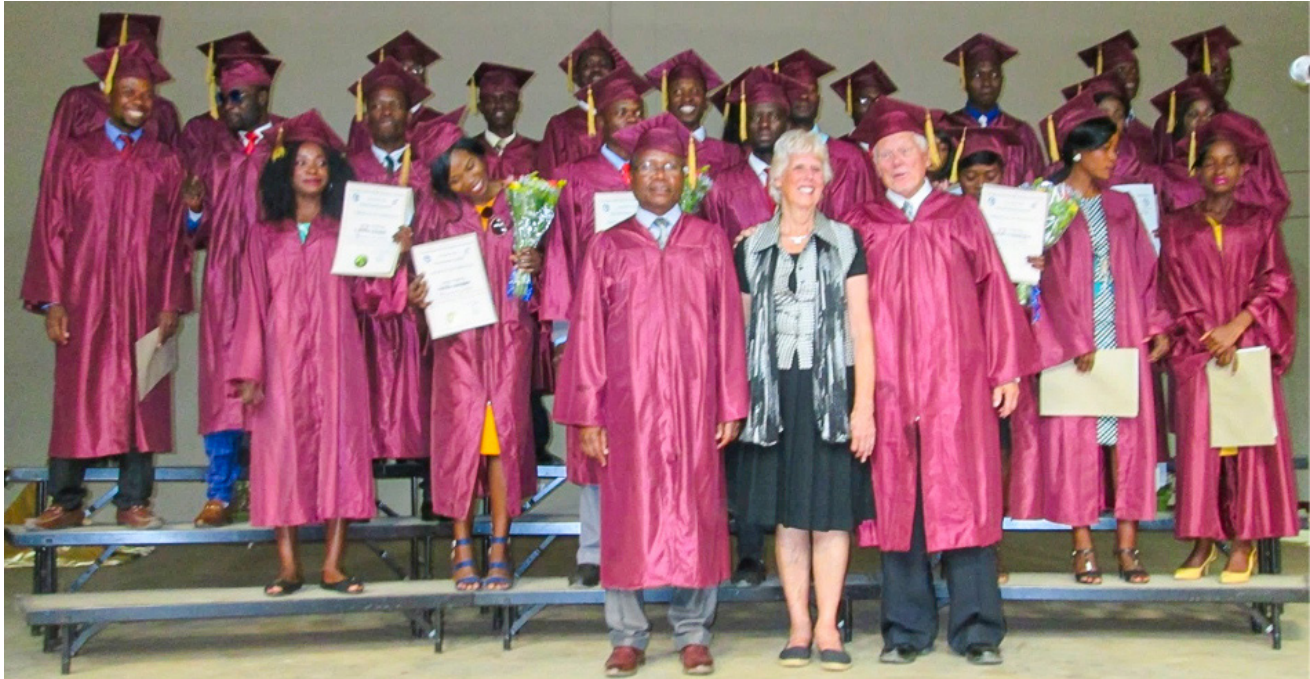
2019 graduation celebration with 26 RICE graduates and the Vice Chancellor of our partner university—Justo Mwale University

“But we do not account our lives of any great value nor as precious to ourselves, if only we may finish our course and the ministry that we received from the Lord Jesus through Rafiki, to testify to the gospel of the grace of God” (Acts 20:24 paraphrased).