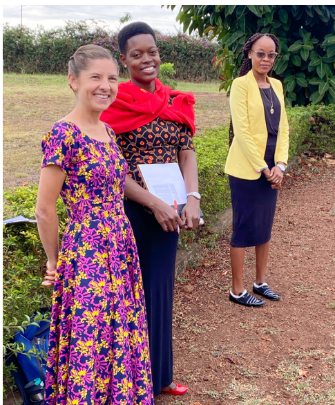
Me with our secondary school headmistress on the first day of school