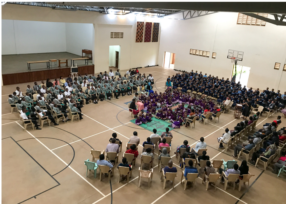
2022 Prayer Gathering

One of the highlights of February was our annual prayer gathering for the whole Village. I was absolutely amazed to look around at our students, teachers, kitchen staff, grounds workers, Rafiki Mothers, RICE students, and other support staff. My heart was full as we sang hymns of praise and prayed to God as our Guide.