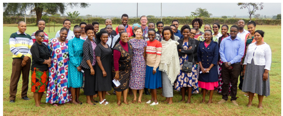
Rafiki Tanzania 2022 Teachers

Our sports program has already taken off this school year. We have had friendly matches with other schools in volleyball, basketball, and soccer. Our focus this year for the coaches is to improve good sportsmanship and increase dedication and commitment. In these beginning games, it has been so encouraging to see our students cheering for one another and showing care for the other teams, while still playing their hardest.