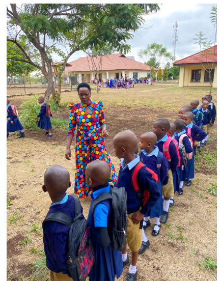
Our new Standard 1 teacher coming from the RICE program.