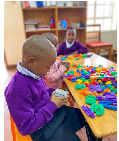
Pre-primary learning centers