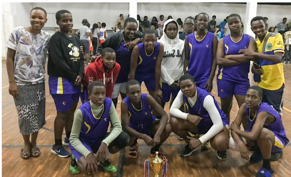
Rafiki girls basketball as the winners of the basketball tournament at a nearby international school

One of the highlights of February was our annual prayer gathering for the whole Village. I was absolutely amazed to look around at our students, teachers, kitchen staff, grounds workers, Rafiki Mothers, RICE students, and other support staff. My heart was full as we sang hymns of praise and prayed to God as our Guide.