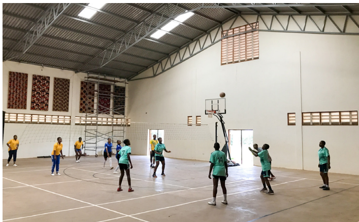
Rafiki Secondary vs. Mawenzi Secondary