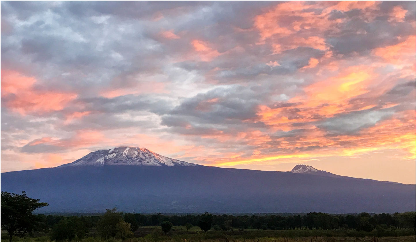
Sunrise on Mount Kilimanjaro

Thank you for your prayers, your care, your donations, your encouragements, and all other forms of support. God is faithful and mightily at work throughout the world to show His power and glory.