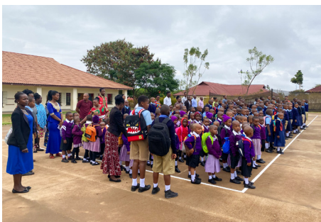
First day of school assembly for pre-primary and primary

So far 2022 has been a year of growth! We now have a total of 355 students in our pre-primary, primary, and secondary schools. Of those, almost 120 of them are in pre-primary. You can imagine that at the beginning of the school year there was a fair amount of crying at the gate and a lot of training for the teachers to do. I am very thankful for the amazing patience and love that the teachers show to each student.