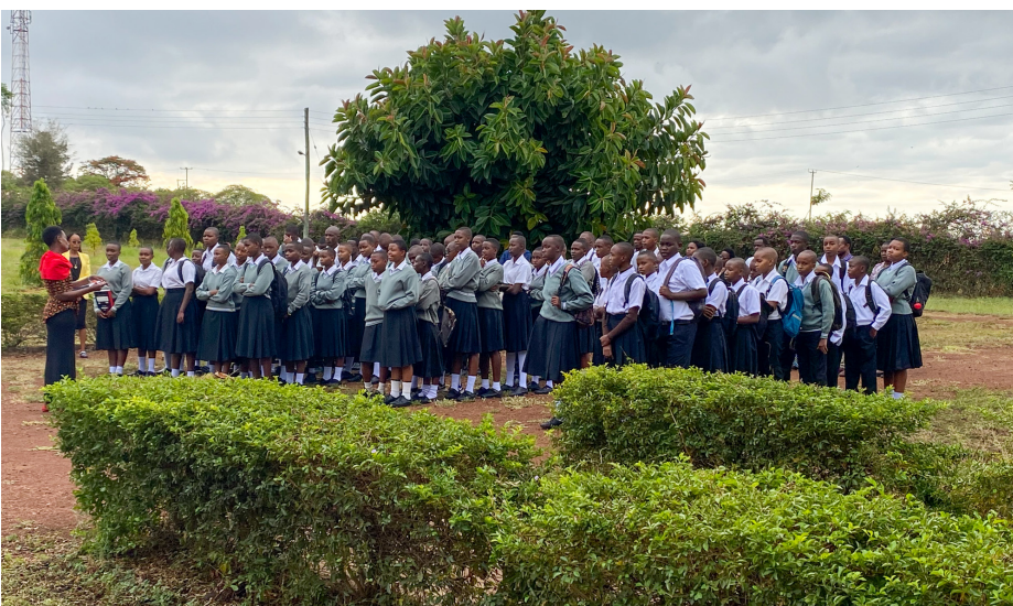
First day of school assembly for secondary

Now that we are a quarter of the way into the school year, the new students are showing great improvement. They are picking up English, learning the routines, and becoming comfortable with the environment. I even happened to catch one of our new 3-year old students leading his class in their morning routine of calendar, shapes, and colors. Quite impressive!