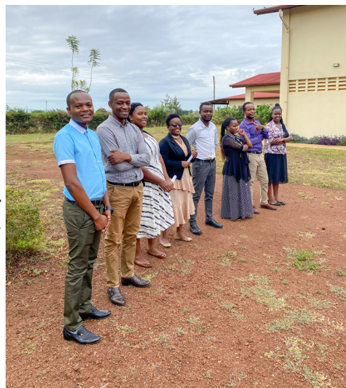
New and returning secondary teachers on the first day of school.