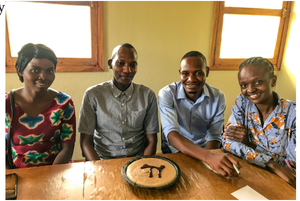
Happy \pi Day!

As we come to April, we are all anticipating the start of rainy season. The fields are planted with maize and beans, so we are ready when the time comes. Until then, I am greatly enjoying some beautifully colorful sunrises and sunsets on the mountain.