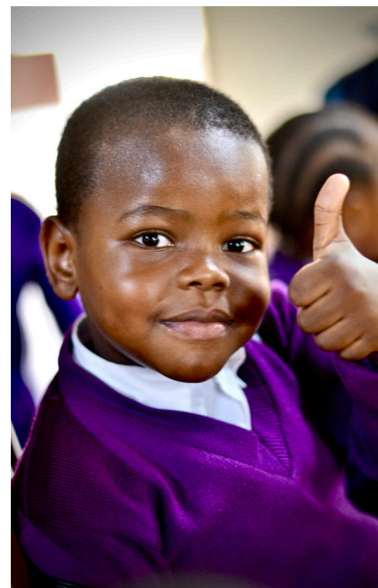
Happy Early Childhood student

We are amazed and thankful as God continues to provide opportunities for us to begin working with other national schools.