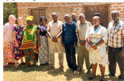
Meeting with a resident's extended family