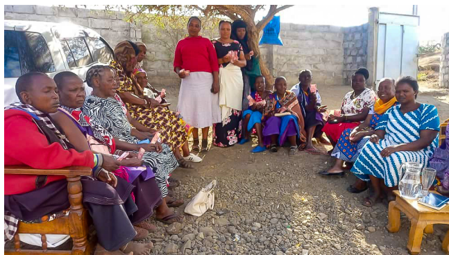
Widows meeting for Bible study, prayer, and praise