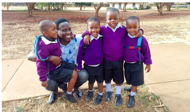
Our IT specialist with his son and preschool friends